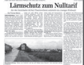
Example of a cross-section of the Kassel-Oberwehren embankment with secondary materials in the core