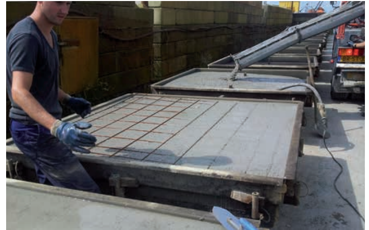
Production of concrete paving slabs

EN 206 provides information concerning the specification, performance, production and conformity of concrete. It is amended with complementary national standards and guidelines. EN 206 applies for structural concrete in situ (ready mixed), for precast structures and structural precast products for buildings and civil engineering works. The standard is not mandatory for concrete products.