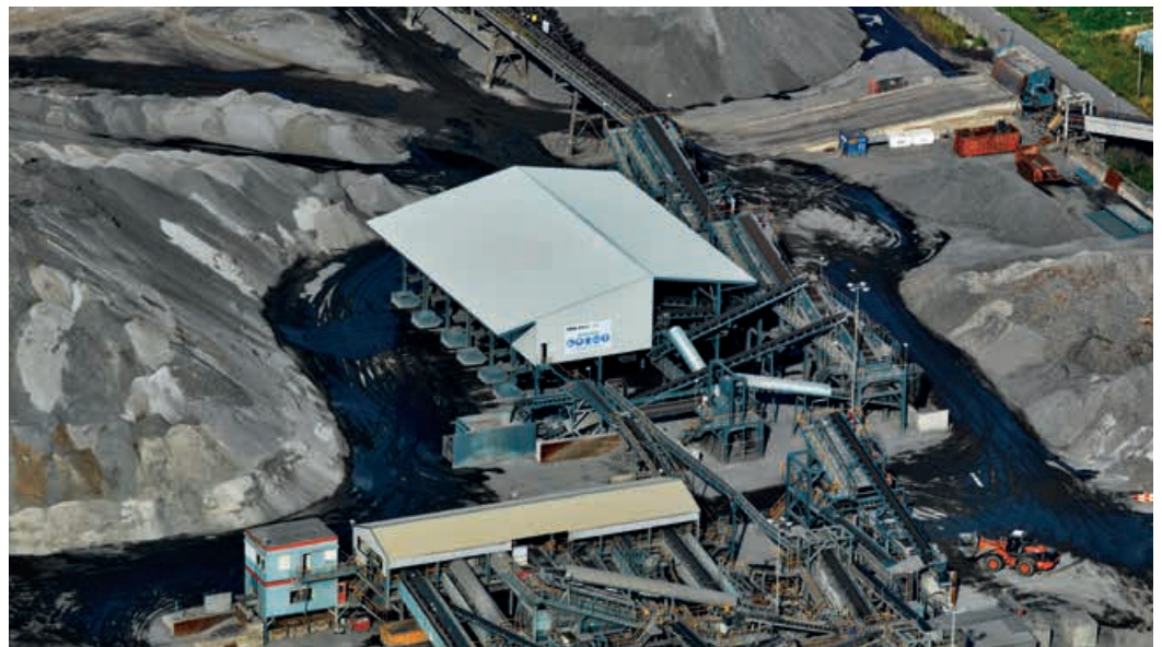
The REMEX Dutch processing facility, operated by its subsidiary HEROS Sluiskil B.V

granova® is not only the sustainable and financially attractive alternative to primary aggregates – it also offers a real competitive edge to concrete producers.